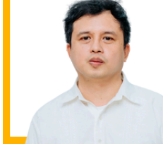
BEVIC BUTCH A. CULE THE ROTARY FOUNDATION