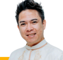
NILFRANZ A. ESCALA SERVICE PROJECT