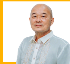
FREDERICK T. VELEZ COMMUNITY ECONOMIC DEVELOPMENT