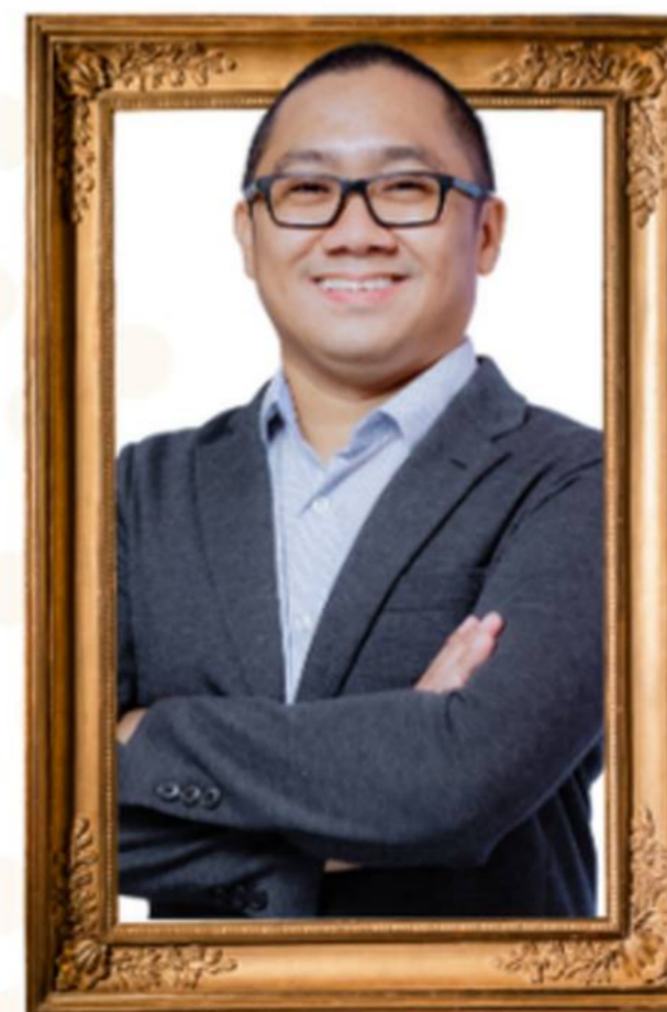
Carlo S. Precioso Foundation