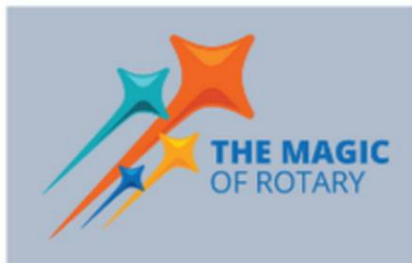
VALERIO, KEITH ALVIN, PHF 1