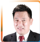
Andrew P. Ng Membership