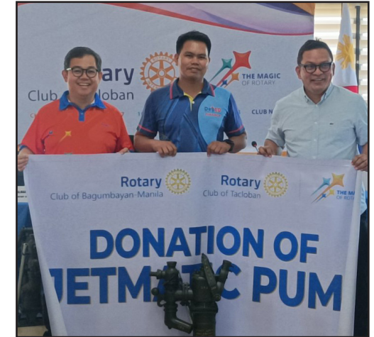
Northern Tacloban City Night High School