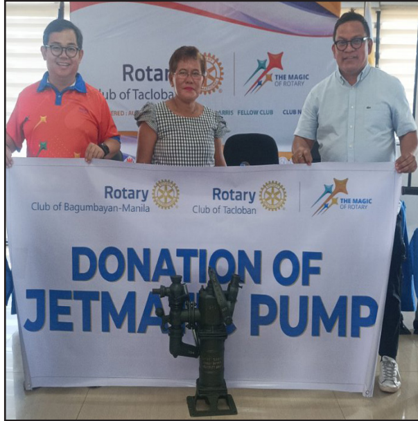
Cirilo Roy Montejo National High School

NOVEMBER 27, 2024 @ RC TACLOBAN CLUBHOUSE, TACLOBAN CITY