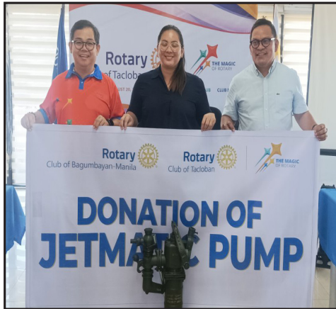
Scandinavian Elementary School

NOVEMBER 27, 2024 @ RC TACLOBAN CLUBHOUSE, TACLOBAN CITY