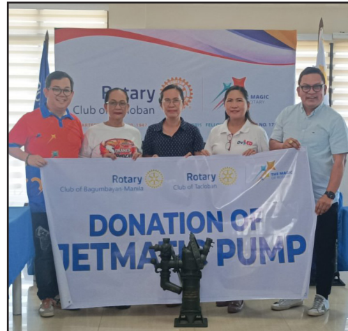
Marasbaras National High School