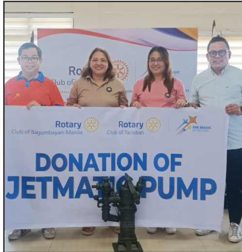
Scandinavian National High School