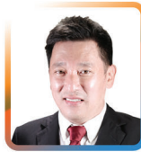
Andrew P. Ng Membership