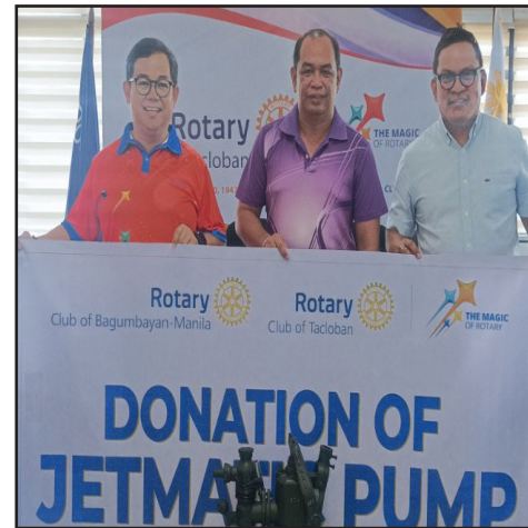
Rizal Central School