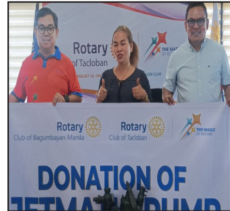
Bagacay Elementary School