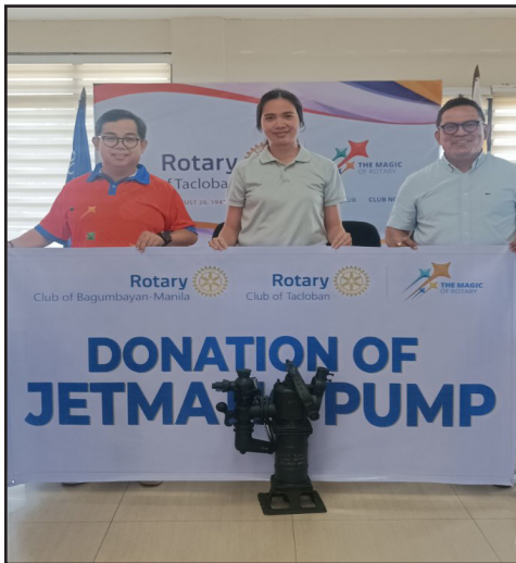
Sagkahan Central School