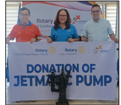
Panalaron Central School