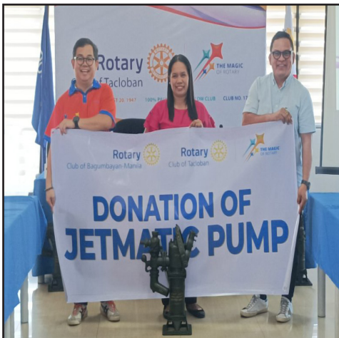
Bliss Elementary School