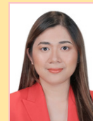
Leamie Retales Government - Tax Collection ID#11830665