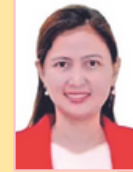
Chona Lamparas Party Needs Supplier ID#10808598