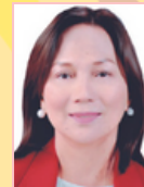
Luna Gaviola General Building Construction ID#5134392