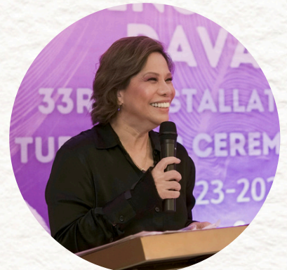
PE Vida Könst June 26