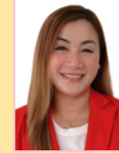
Irish May Tan Fish Farming ID#11539191