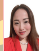
Caryl Lim Furniture & Houseware Retailing ID#11539204