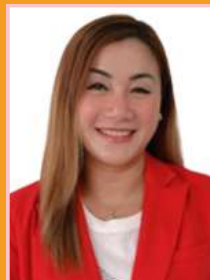
Irish May Tan Fish Farming ID#11539191