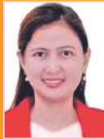
Chona Lamparas Party Needs Supplier ID#10808598