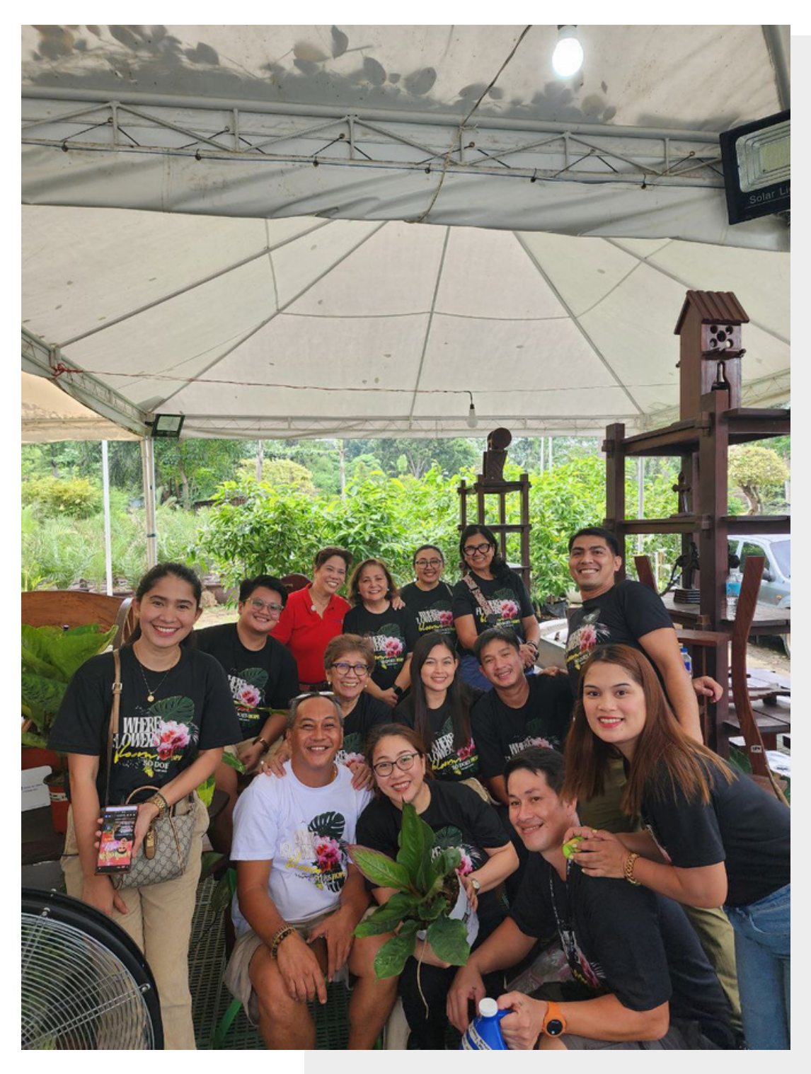
Plant for Hope 5 SM Ecoland, Davao City December 28, 2024