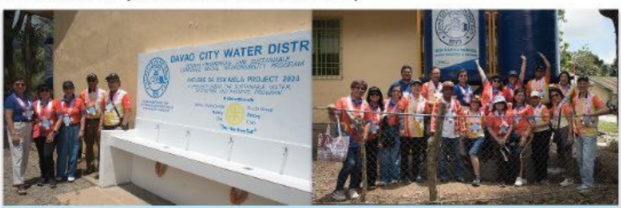
DCWD, RCSD, and RCWWD donate handwashing and rainwater harvesting facilities to Damilag Integrated School.