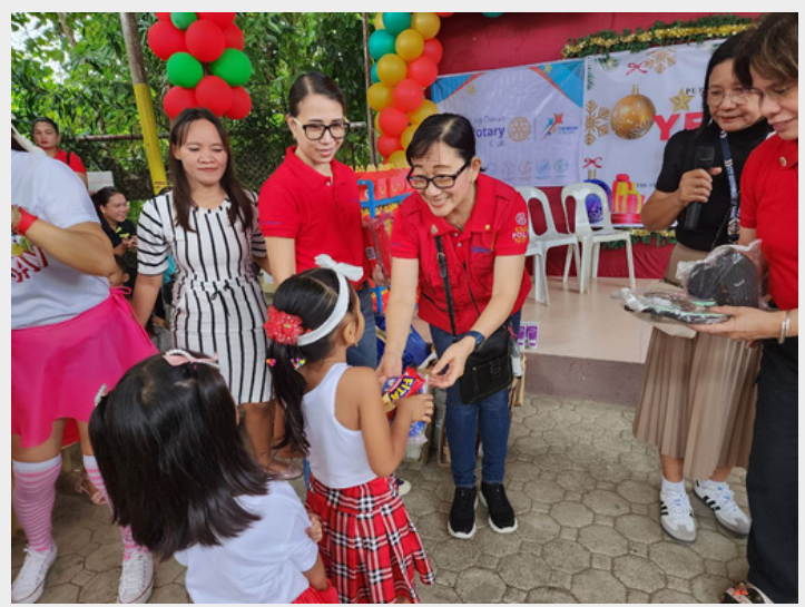
RCWWD DCCs 1 and 2 Year-End Giving