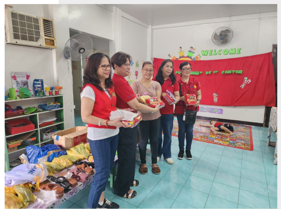
Duha DCC and RCC Year-End Giving

Duha Village, Davao City December 17, 2024