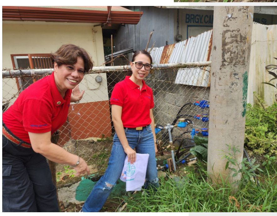
RCWWD DCCs 1 and 2 Installation of Water Line Connections in Partnership with DCWD