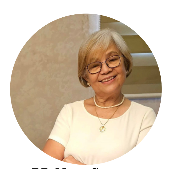
PP Nen Santos January 15