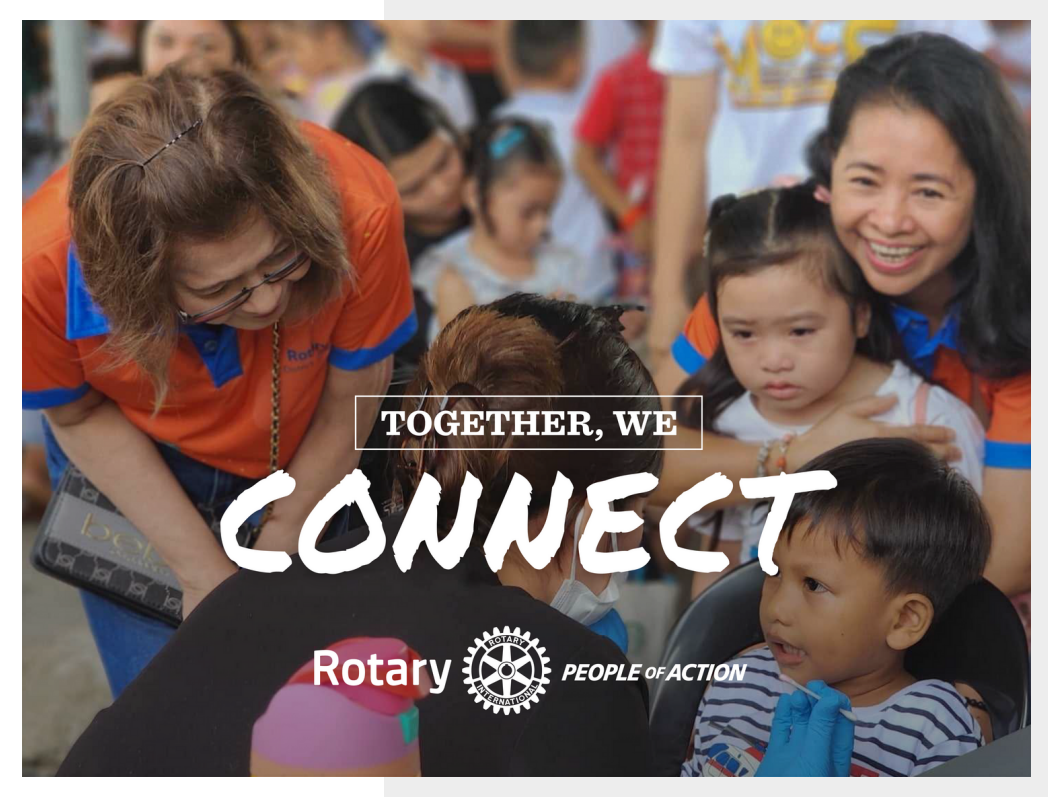
16th Make One Child Smile

Sto. Tomas, Davao del Norte December 14, 2024